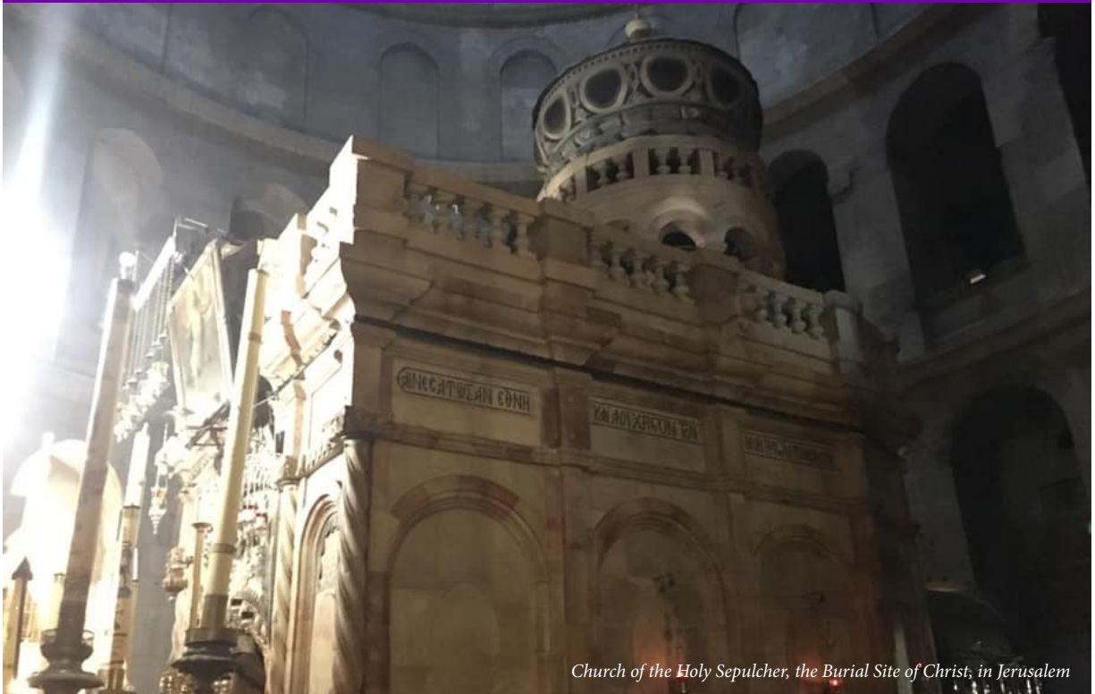
Church of the Holy Sepulcher, the Burial Site of Christ, in Jerusalem

Saint Mary of the Immaculate Conception Roman Catholic Church