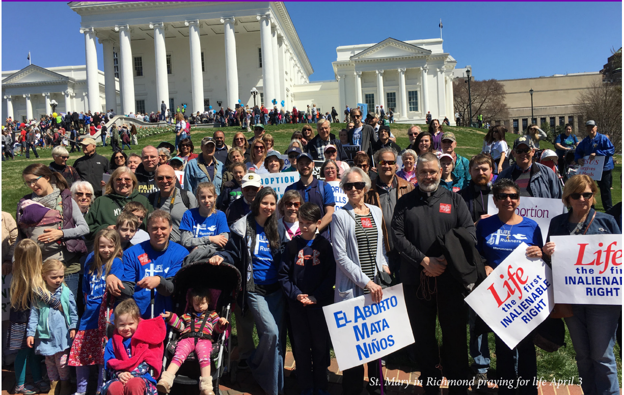
St. Mary in Richmond praying for life April 3

Saint Mary of the Immaculate Conception Roman Catholic Church