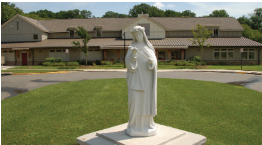
St. Rose of Lima Retirement Villa - Dedicated August 2010