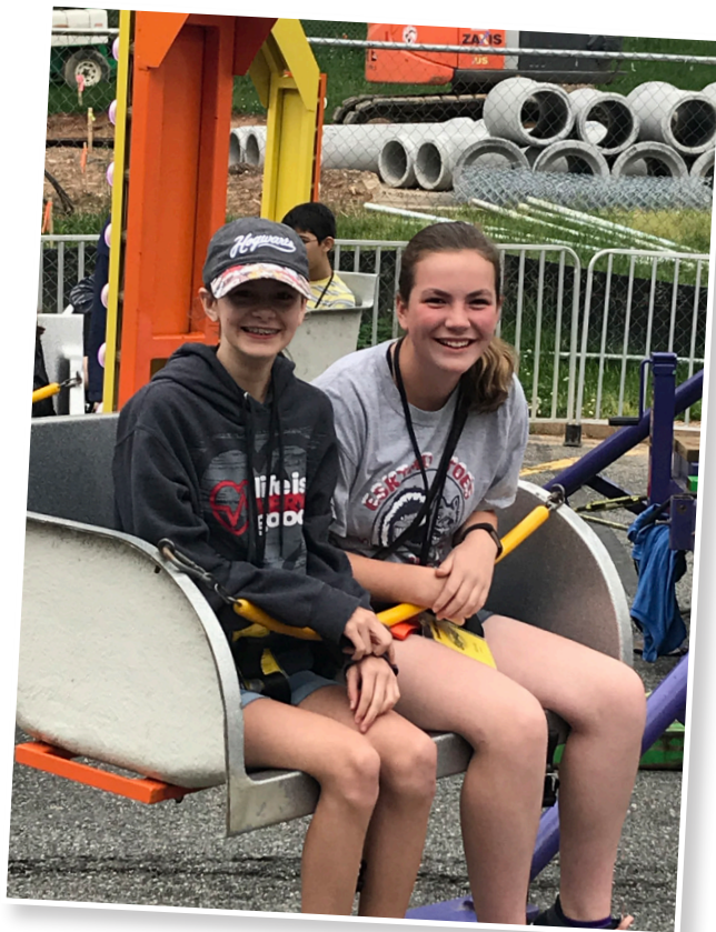
A few pictures from the Middle School Bash