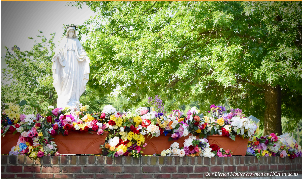
Our Blessed Mother crowned by HCA students

Saint Mary of the Immaculate Conception Roman Catholic Church