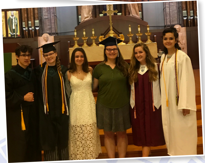
Some of our seniors at the Baccalaureate Mass. Congrats to all graduates!