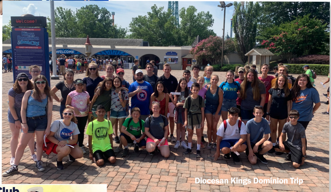
Diocesan Kings Dominion Trip

1st & 3rd Friday of the Month 6:30pm-8pm Parish Life Center