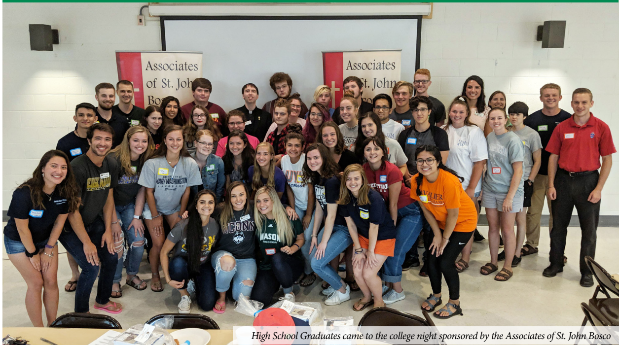
High School Graduates came to the college night sponsored by the Associates of St. John Bosco

Saint Mary of the Immaculate Conception Roman Catholic Church