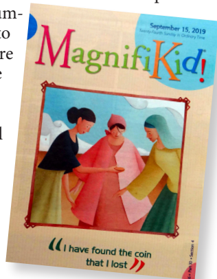
Religious Education Enrollment

Each Sunday, a collection is taken up at Mass. Christians place money in the basket as it is passed around. ... The money is used to keep the church buildings in good repair, to provide for the needs of the priests, to pay for supplies and workers in the parish, and to help the very poor.