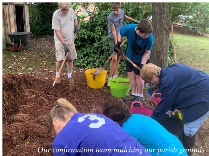
Our confirmation team mulching our parish grounds