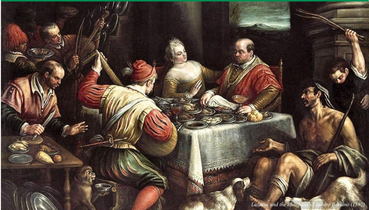
Lazarus and the Rich Man - Leandro Bassano (1595)

Saint Mary of the Immaculate Conception Roman Catholic Church