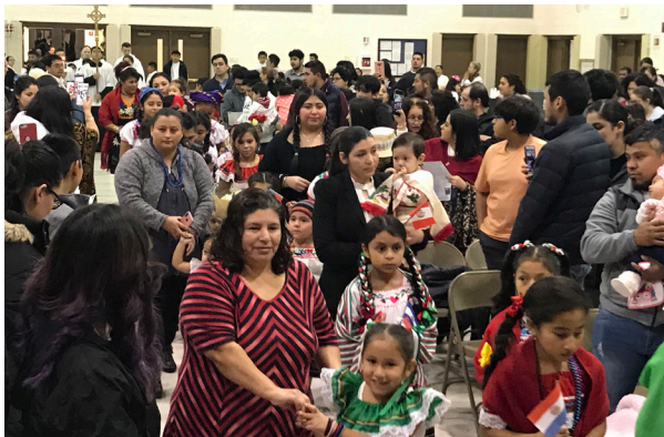
Imágenes de la Misa de Nuestra Señora de Guadalupe a la izquierda