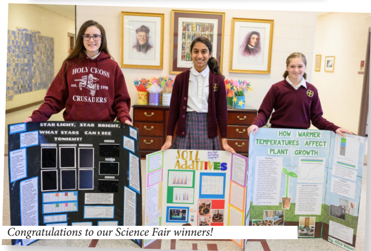
Congratulations to our Science Fair winners!