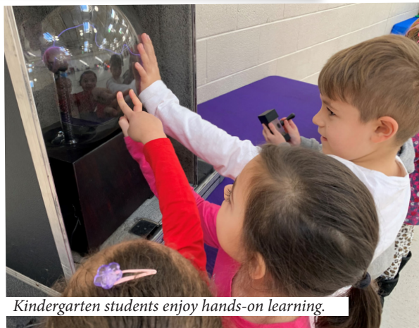
Kindergarten students enjoy hands-on learning.