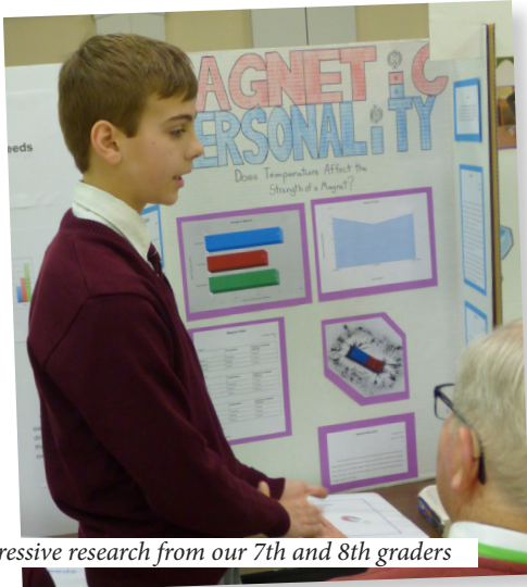
Impressive research from our 7th and 8th graders