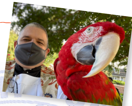
Enjoying the Blessing of the Animals