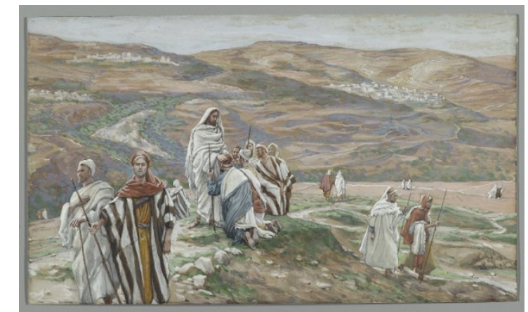
He Sent them out Two by Two (Il les envoya deux à deux) James Tissot, 1886-1894

Readings begin on page 90 of Celebremos/Let Us Celebrate (missalette); for our Mass at Holy Cross Academy, Gather (hymnal) no. 1135.