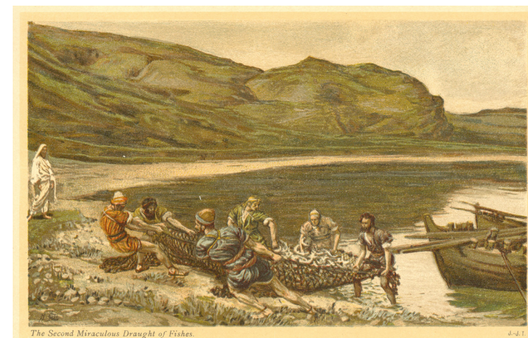
The Second Miraculous Draught of Fishes James Tissot, 1836-1902

Readings begin on page 26 of Celebremos/Let Us Celebrate (missalette); for our Mass at Holy Cross Academy, Gather (hymnal) no. 1069.