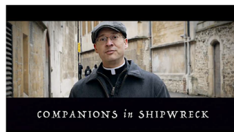
COMPANIONS in SHIPWRECK

Good relationships are a vital part of human well-being. In fact, studies show that those with the healthiest relationships live the longest! But where can we see these friendships lived out? Look no further than the life of famed author J.R.R. Tolkien. The relationships he exhibited are a wonderful example for all of us to follow, especially with those we may disagree with. As Tolkien described marriage, it's all about being “companions in shipwreck.”