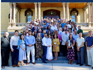
Missionaries to the Family Class of 2021

In partnership with the McGrath Institute for Church Life at the University of Notre Dame