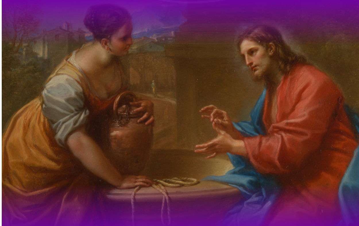
"Jesus and the Samaritan Woman at the Well," glass painting by unknown German, circa 1420 (Metropolitan Museum of Art)

Saint Mary of the Immaculate Conception Roman Catholic Church 1009 STAFFORD AVENUE - FREDERICKSBURG, VIRGINIA