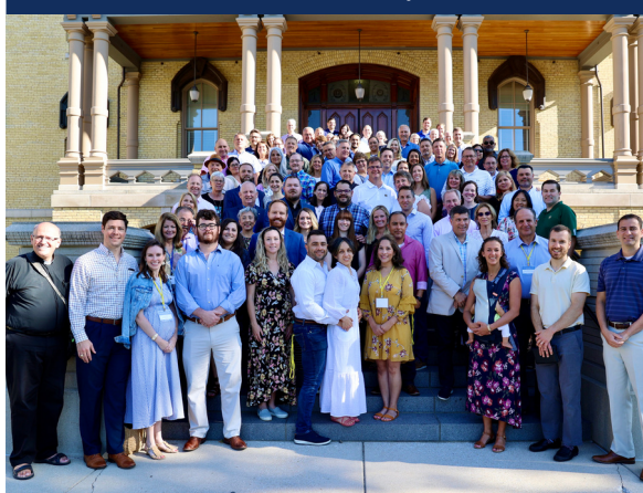
Missionaries to the Family Class of 2021