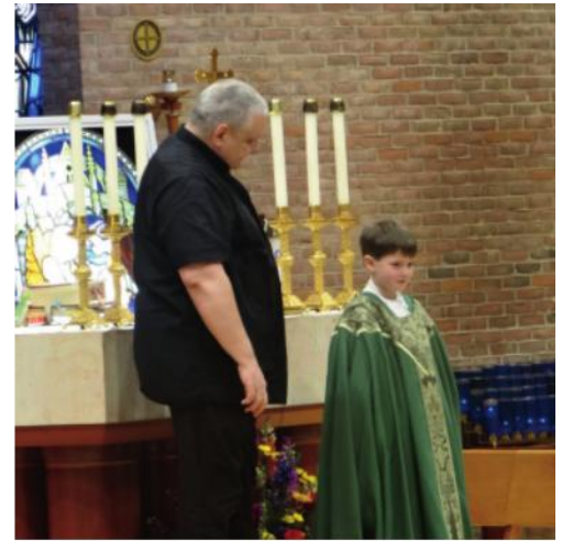
"The Mass is the school of the soul." – St. John Vianney

The Teaching Mass is a mandatory event for all students in Religious Ed. Bring your Event Attendance slips to class next week – October 20-22 – for attendance credit.